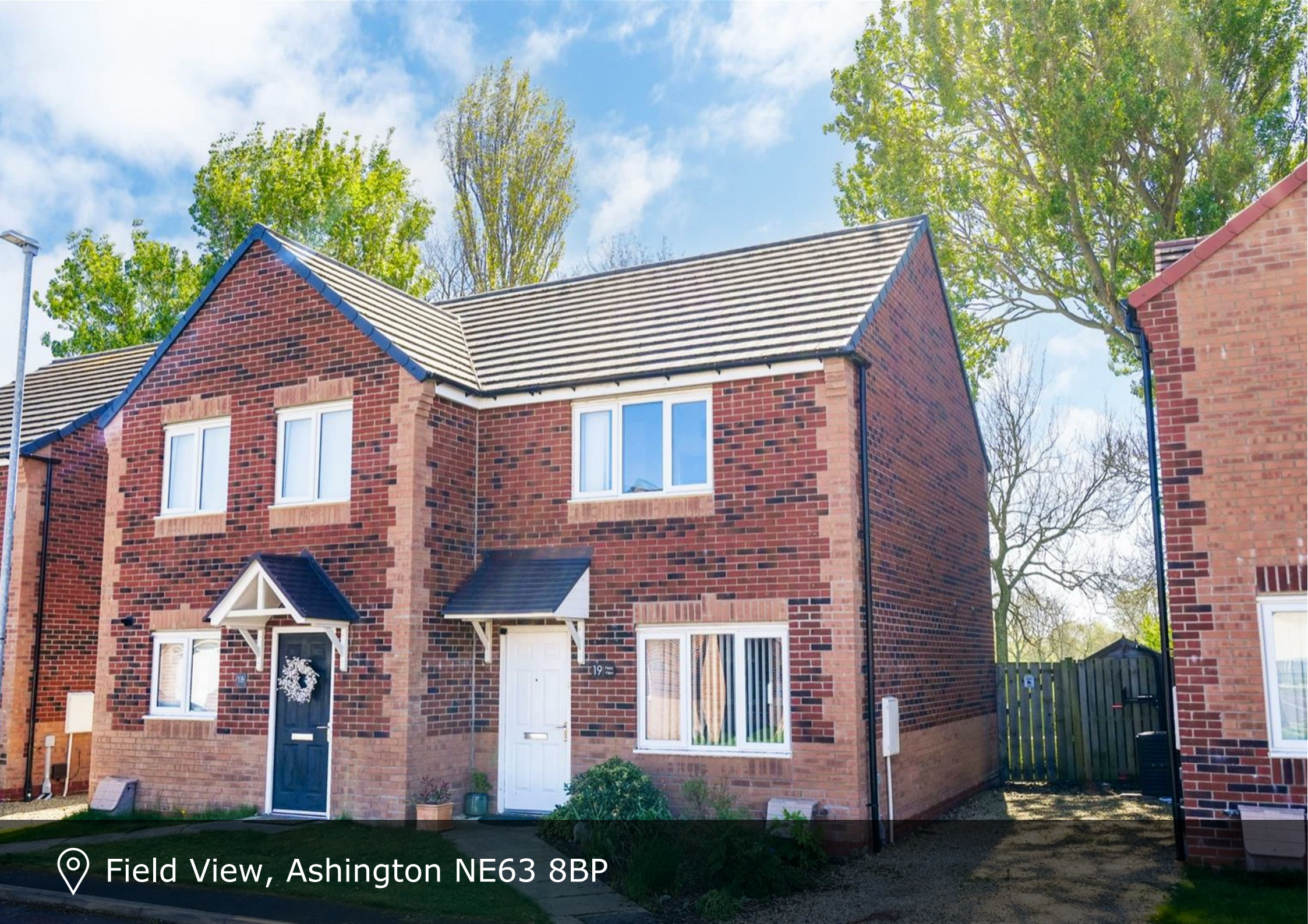
📍 Field View, Ashington NE63 8BP